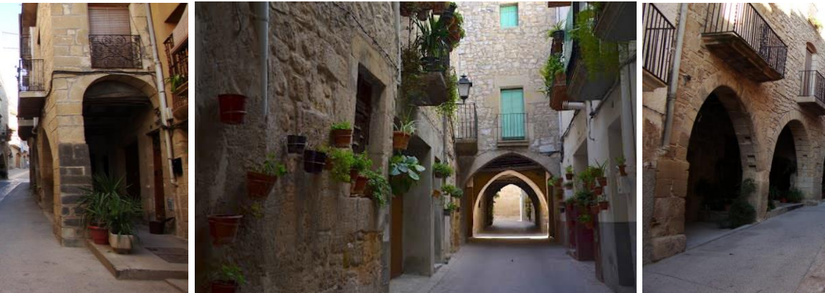
Historic center of Batea

Activity open to the public: tickets can be purchased at the fair.