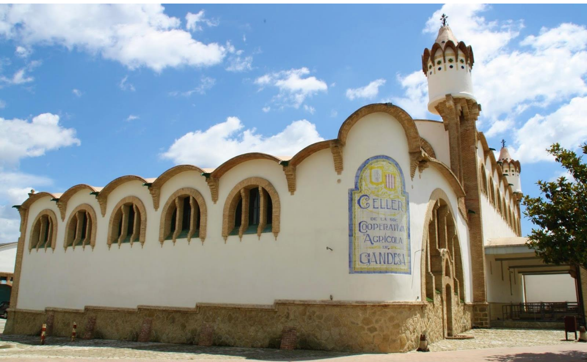
Celler Cooperatiu of Gandesa