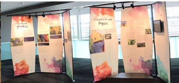
"Passage of the Grenache: from matter to soul"