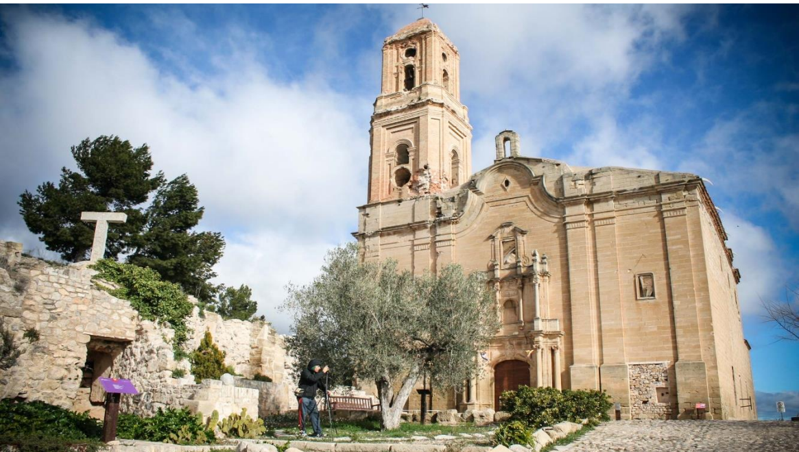
Poble Vell de Corbera Church

The tickets for the dinner as well as for the different packages can be purchased on the web: http://concursgarnatxes.doterraalta.com