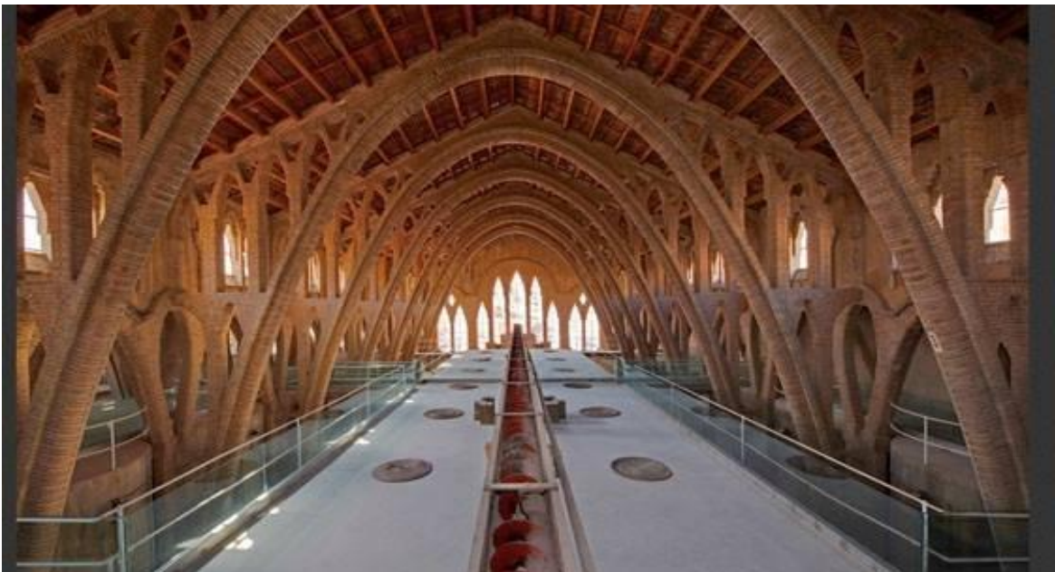
Wine Cathedral of Pinell de Brai